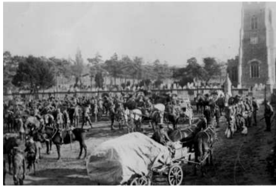
Church Plain - This photograph from WW1 shows the Cheshire Yeomanry, who were billeted at Langley Hall.