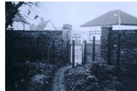
Bugdon House - see the remains of a WW2 blockade on George Lane, designed to prevent enemy troops crossing the river.