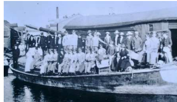
Loddon Staithe - During WW1, recuperating soldiers enjoyed occasional wherry trips to Chedgrave Common.