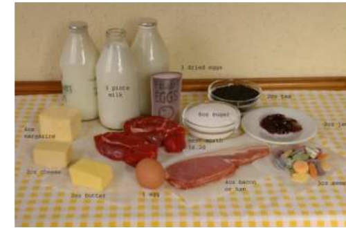
Local Food Office - Food was rationed in WW2. Check out the display in Youngs window, showing ration books and groceries from the time.