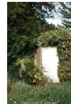
3 Beccles Road (Rodwell House) - The garden still houses a WW2 Air Raid shelter built to accommodate around 20 people.