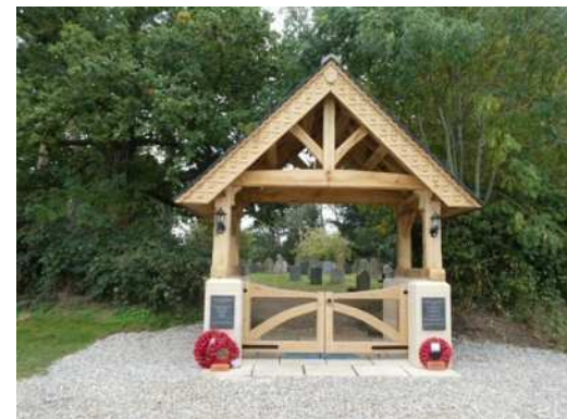
Chedgrave Lychgate - formally dedicated on 30 September 2018 to remember those that fell in WW1 and WW2.