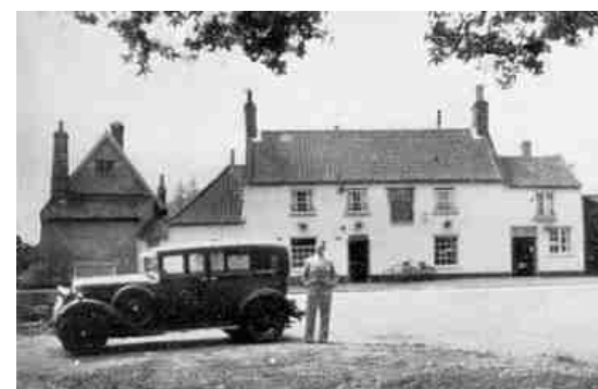
Chedgrave White Horse - During WW2, the Women's Voluntary Service ran a canteen here, where soldiers played games and relaxed. Photo dated 1936.