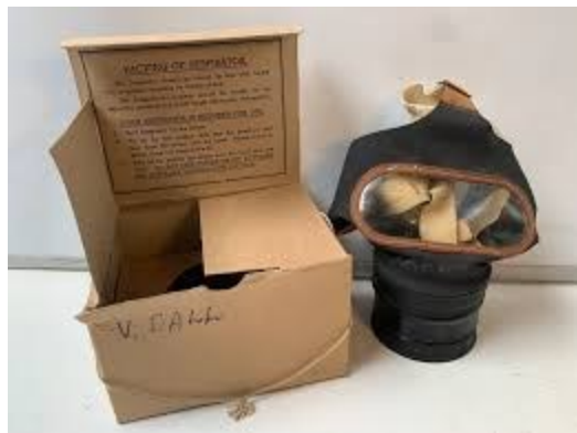
The Old School, Church Plain - During WW2, the school here doubled in size to welcome evacuees from East London. All children had to carry a gas mask for use if there was an attack.