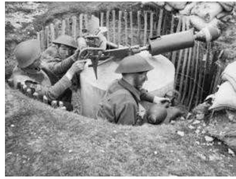
Old Market Green/Playing Field - Find the base for the Spigot Mortar Thimble. A powerful anti-tank weapon could be placed on here for WW2 defence.