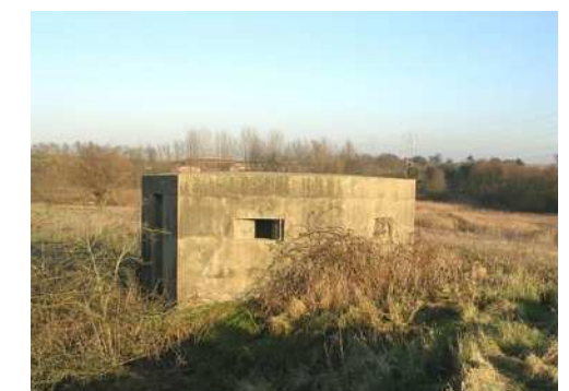
Pillboxes - Three WW2 pillboxes once stood in Loddon. These structures allowed soldiers to defend the area from invasion. The photograph shows the one that is adjacent to High Bungay Road/A146 if you face East into the field.