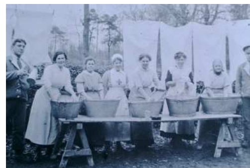
WW1 Red Cross Hospital Nurses - This is a photograph of the nurses on wash day.