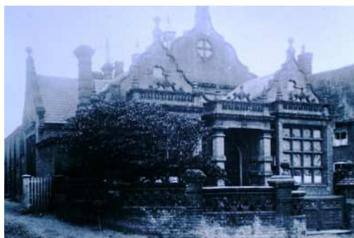
Loddon Town Hall - A 'Welcome Home' dinner was held here in 1919 for WW1 soldiers. In WW2, this building became the Civil Defence HQ. Even boxing matches were held here!